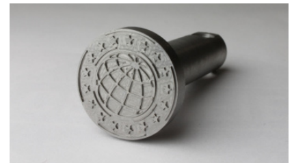
Example of a generic tactile impression die.

The tactile impressor feature, designed exclusively for use in the Datacard® SD460™ card printer and CD800™ card printer with inline lamination module, offers an affordable and entry-level security feature ideal for any card program. This patent-pending feature utilizes a mechanical die within the laminator that physically impresses a generic or custom design directly onto the card substrate and overlay or patch laminate in the same pass. The final output is a card with added counterfeiting and tampering resistance that will impress any cardholder.