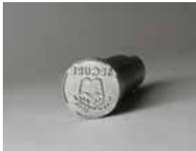
.5 in. (12.7 mm) Education Design