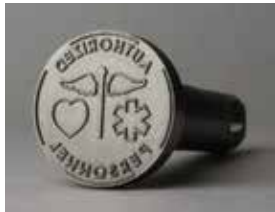
.9 in. (22.86 mm) Medical Design