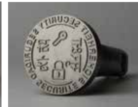
.9 in. (22.86 mm) Security Design