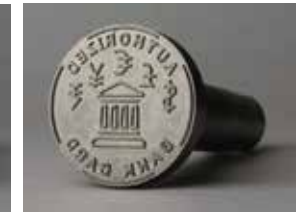
.9 in. (22.86 mm) Bank Design