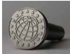
.9 in. (22.86 mm) Global Design